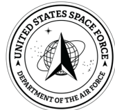
SPACE FORCE SEAL